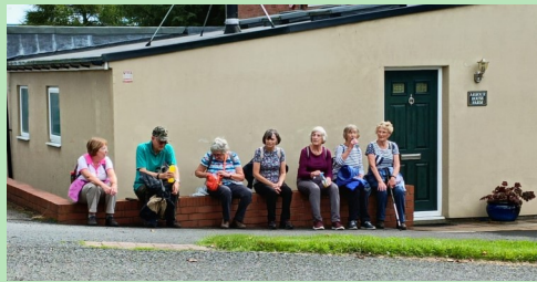
Wall flowers in full bloom!