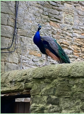
Cock of the North